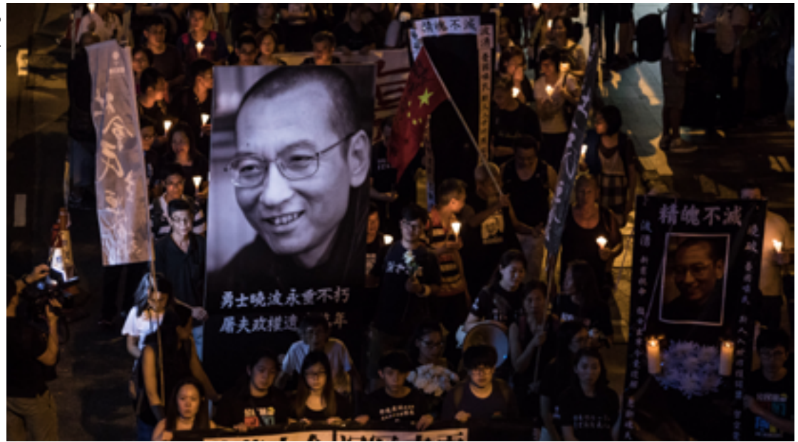
People attend a candlelight march for the late Chinese Nobel Peace Prize laureate Liu Xiaobo in Hong Kong. [2017]

In China , where the government views foreign organizations with suspicion, new legislation has been introduced to tightly control their activities. The Foreign NGO Management Law<sup>177</sup> imposes increased restrictions on foreign and domestic NGOs in terms of registration, reporting, banking, hiring requirements and fundraising. The Law particularly targets foreign NGOs to prevent them conducting "political activities" or activities deemed as "endangering national unity, national security or ethnic unity or harming China's national interests and societal public interests", without specifying what these activities are. It gives public security organs ample powers such as enabling them to summon NGO representatives for questioning; to conduct on-site inspections and to seize documents; to make inquiries into, and possibly request the freezing of bank accounts; to order the suspension of activities; withdraw registration certificates; and to list organizations as "unwelcome" if they are suspected of carrying out "illegal" activities. Public security organs can also order