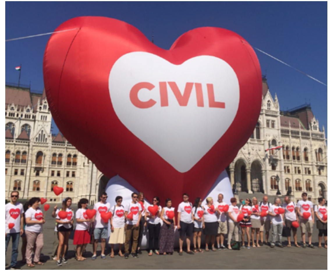
Activists take part in a stunt outside the Parliament in Hungary's capital, Budapest, to tell MPs that people working for a Hungary that is fair and safe for everyone need to be protected, not attacked or threatened. [2018]

Several countries are introducing or applying measures that are burdensome for those wanting to register and operate an NGO, particularly if they hold views critical of the authorities or if their activities are deemed undesirable. Barriers to registration are particularly widespread but additional requirements include the imposition of excessive bureaucratic requirements such as providing detailed and frequent activities reports. In addition, many states also allow for the authorities to subject organizations to close monitoring and surveillance.